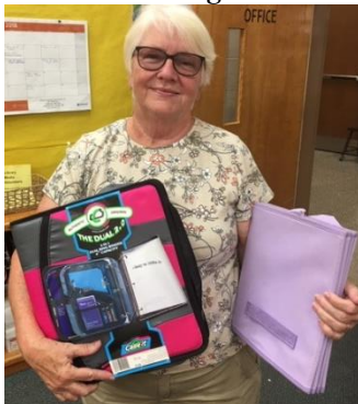
We donate supplies and our time!