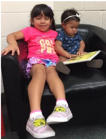
We read together!