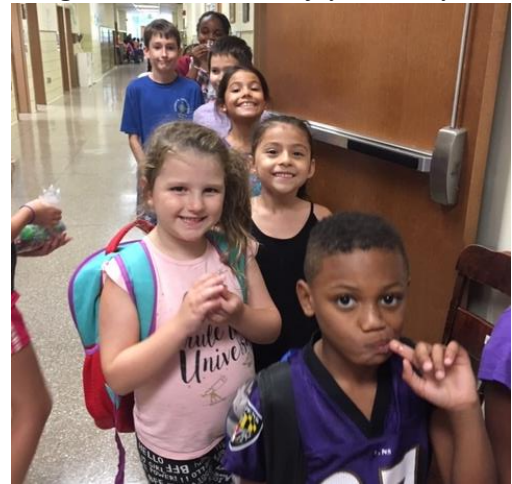
We are Pawsitive Powers Winners!