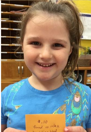
We are honest!