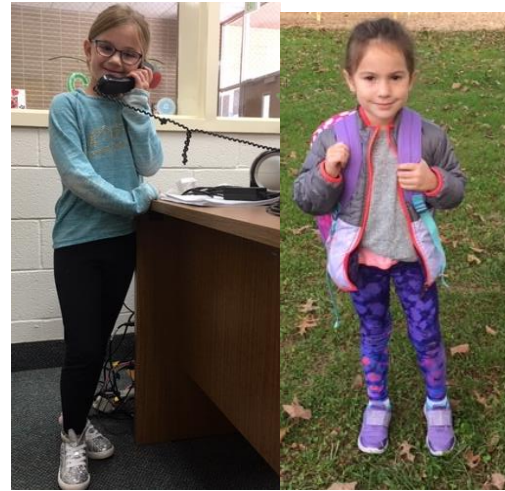
We work together!